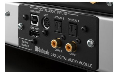
Typical DA2 installed.